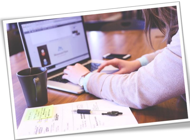
Every Police Department has a website that is a wealth of information. This department is no exception! www.glendaleaz.com/police

REMEMBER: You're trying to get a job...you're not going to the club or on a date. Be professional in everything you do!